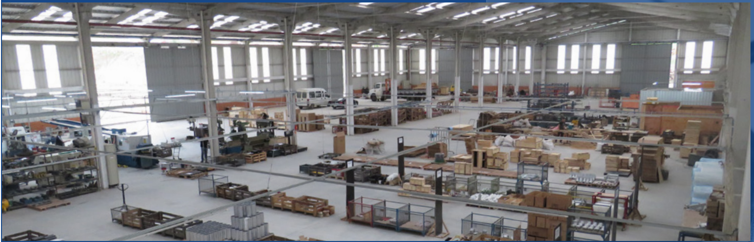
Manufacturing Center GAHO Santa Catarina, Brazil.

GAHO Alignment Pro Tools is a worldwide provider of vehicle suspension repair tools.